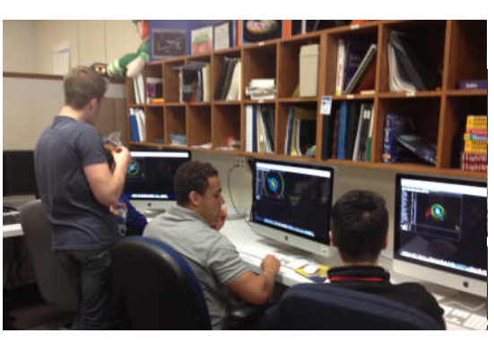
Our IB Physics students worked with Riley and Wakarusa HS students at QuarkNET, and over 50 different schools via simulcast from 20 different countries today.