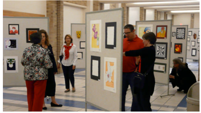
Art displays in the hallway